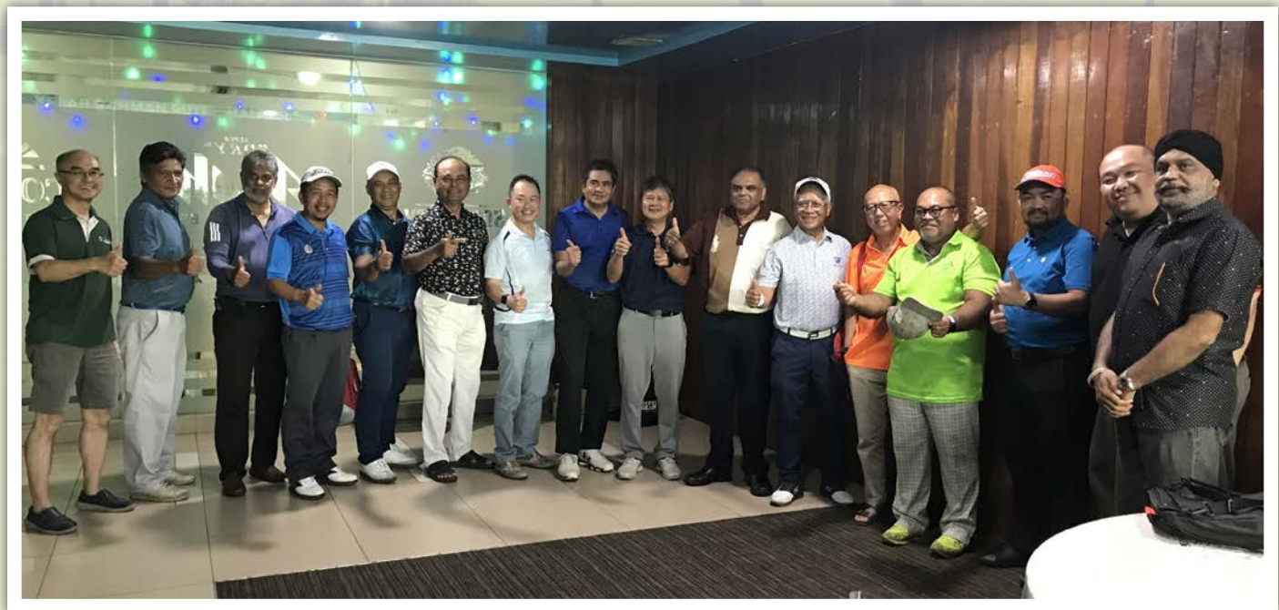
Group photos with all members

friendly and relaxed atmosphere. Representatives from BEM, BAM, BQSM, JKR and LLM were invited to grace the event. The golf game was an excellent opportunity for knowing each other, professional networking and forging closer ties. The participant teed off at 8.15 am and ended at 1pm. The weather was perfect for golf. After a delicious lunch, the ACEM president presented prizes to the top 10 golfers.