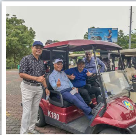
Some of the members during the game day.