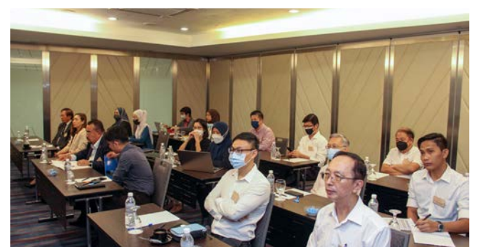
Participants who attended the course.