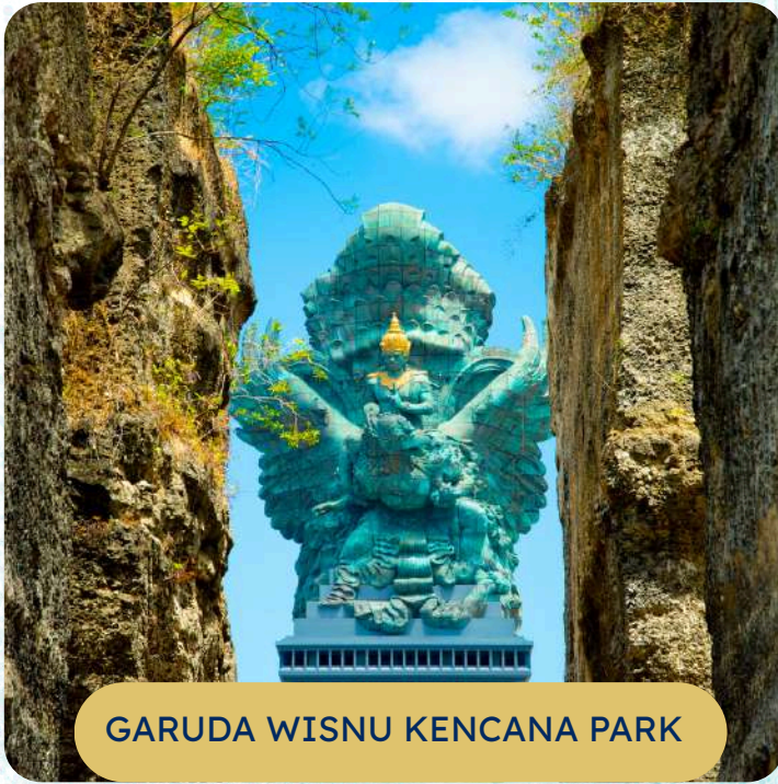
GARUDA WISNU KENCANA PARK