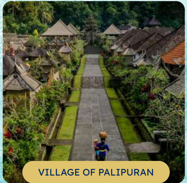
VILLAGE OF PALIPURAN