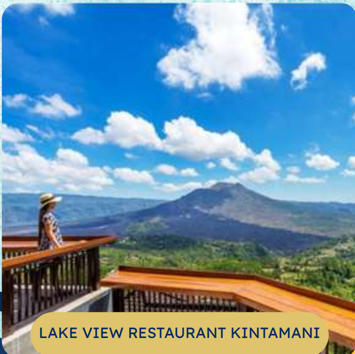
LAKE VIEW RESTAURANT KINTAMANI